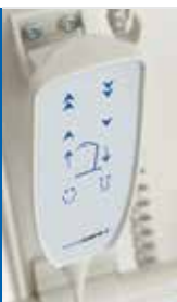
A Manual control with two speed variations