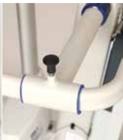
B Adjustable handle bar