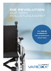
Product brochure VarioXX Wheelchair