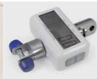
Accessories (optional) The patient scale is a class 3 scale with a max. patient weight of 400 kg.