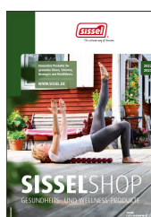
Catalogue SISSEL Quality Products