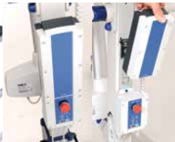
D Care electronics with intelligent cycle and operating data counter. Soft start/stop function, emergency operation for hoisting and lowering.