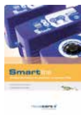
Product brochure Smartline