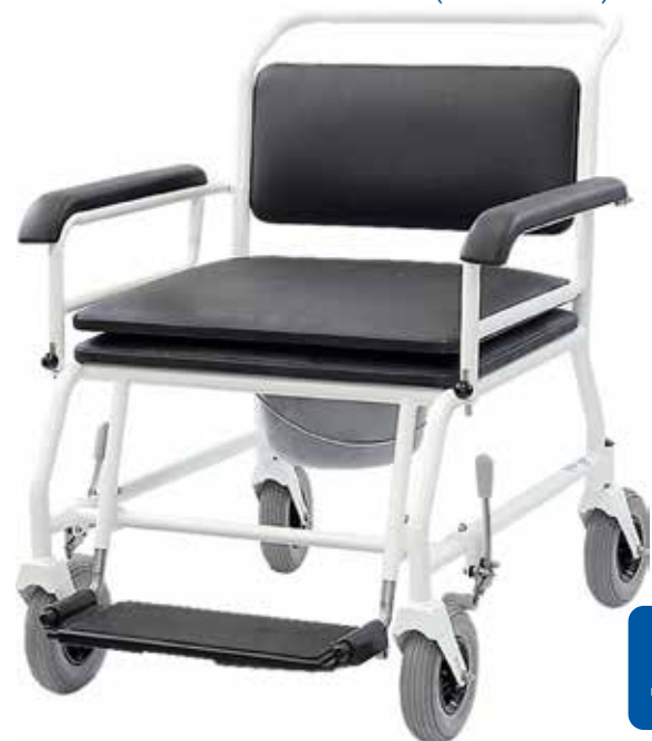
Shower Chair (wheeled version)