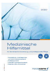
Catalogue Medical Devices – for clinical and home use