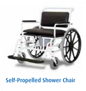
Self-Propelled Shower Chair