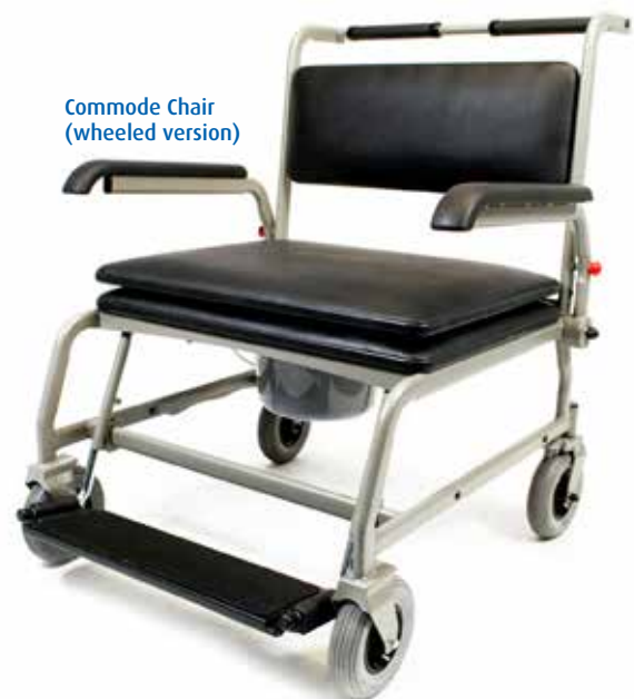
Commode Chair (wheeled version)