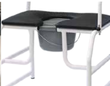
C Innovative changing system at the sling bar for quick insertion of different sling models, e.g. slings for adiposity.